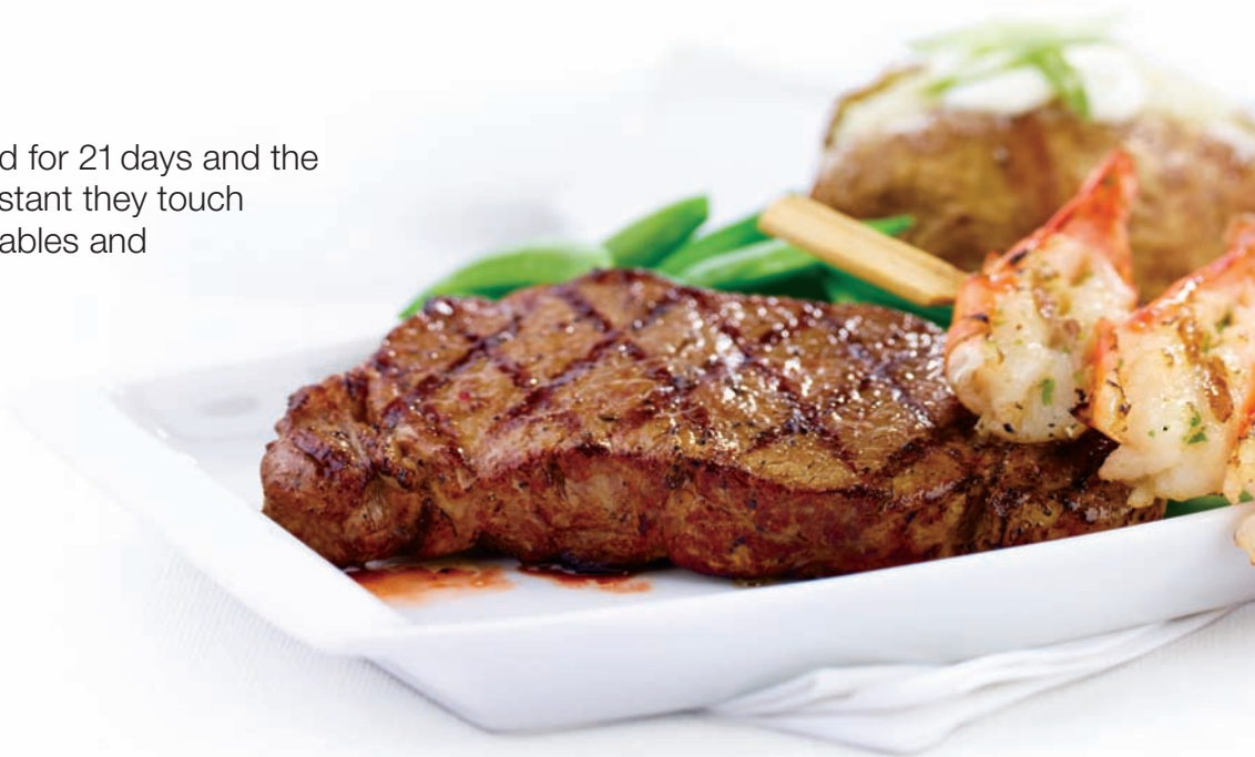
10 oz. New York Steak with a Grilled Shrimp Skewer