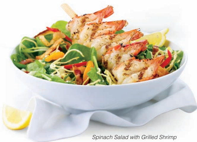
Spinach Salad with Grilled Shrimp

Baby spinach, Mandarin oranges, red peppers, chopped egg and bacon tossed in orange poppy seed dressing and topped with a skewer of grilled shrimp, crisp onion strings and Feta cheese. $13.99 Lose the shrimp. $10.99