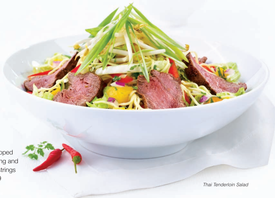
Thai Tenderloin Salad

Crisp romaine lettuce and bacon bits tossed with our original Caesar dressing, Parmesan cheese, garlic crustini and grilled seasoned chicken breast. $12.99 Lose the chicken. $9.99