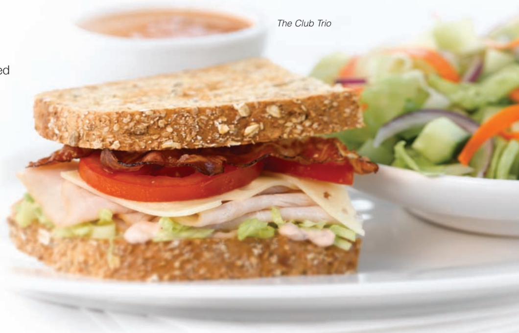
The Club Trio

Half a Club sandwich, served with Roasted Red Pepper soup and your choice of house or Caesar salad. $12.49