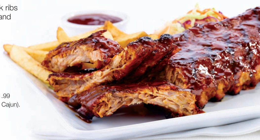
Case's Famous Back Ribs

A quarter rotisserie chicken breast and a half rack of our mouth-watering slow-roasted back ribs. Comes with fries, slaw and hot chicken BBQ dipping sauce. Leg $21.99