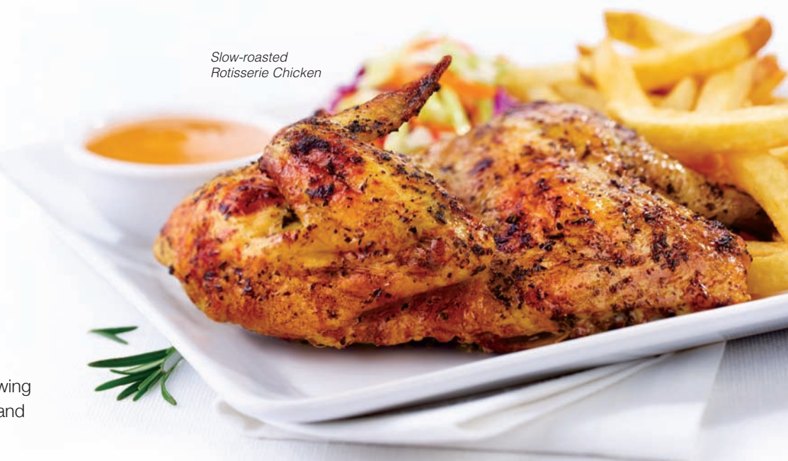
Slow-roasted Rotisserie Chicken

Buffalo – Coated in your choice of mild, medium or hot wing sauce. Served with fries, carrots and celery sticks, slaw and Blue cheese dip. $12.99