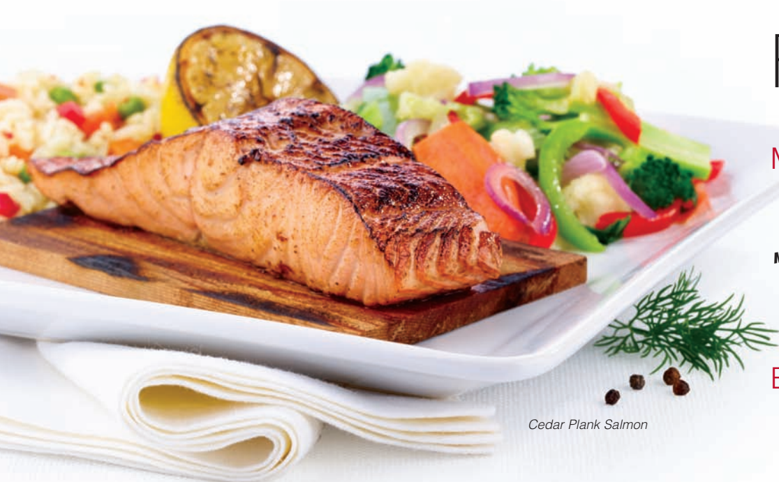
Cedar Plank Salmon

Shrimp, Andouille sausage, chicken and mixed vegetables simmered in a spicy Cajun tomato sauce with rice pilaf. Served with garlic bread. $15.99